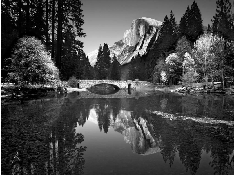
Figure 1: Example photo with high resolution. Caption created with “insert, reference, caption, figure” and the style changed to “thesis-figure caption.”